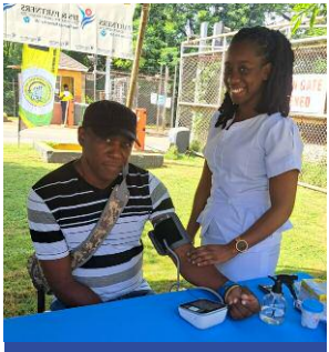
Health Checks underway at the Ewarton Branch