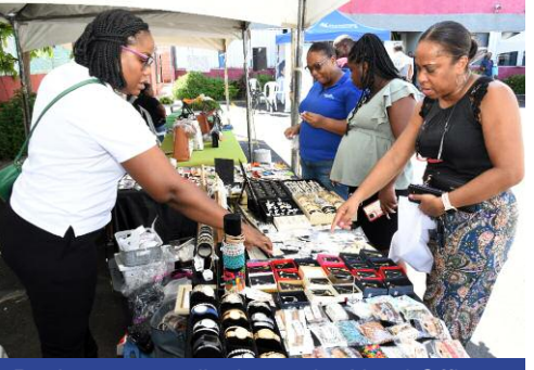
Businesses on display at the Head Office