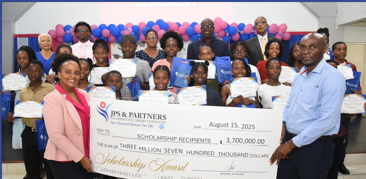
JPS & Partners Cooperative Credit Union's 2025 Scholarship and Bursary recipients beam with pride at the 2025 Scholarship Awards Luncheon.

JPS & Partners Co-operative Credit Union Ltd., proudly serving Jamaicans since 1956, continues to champion education through its Annual Scholarship Programme. On Friday, August 15, 2025, the Credit Union hosted its Scholarship Awards Ceremony at Swallowfield Chapel, celebrating twenty-seven (27) years of empowering students and families through financial support and academic recognition.